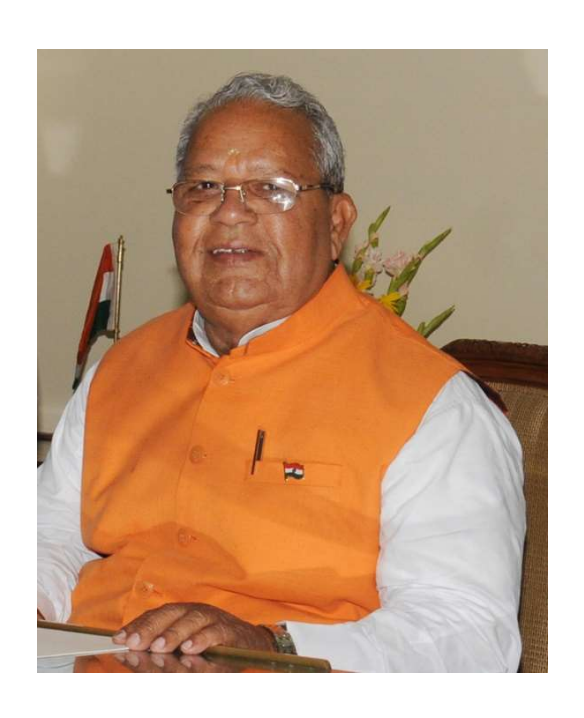
Hon'ble Chancellor Shri Kalraj Mishraji Governor of Rajasthan