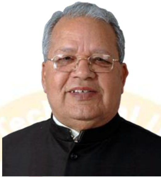
Hon'ble Chancellor Shri Kalraj Mishra Governor of Rajasthan